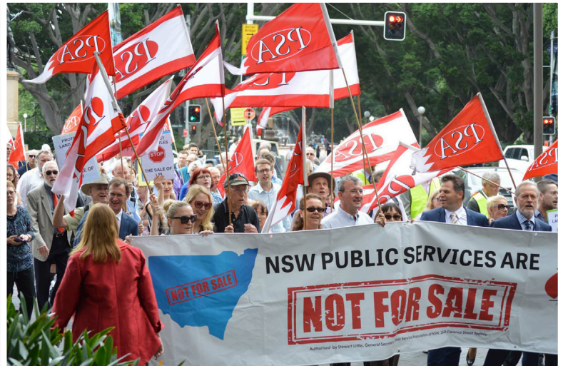
People travelled from across NSW to rally against the Government's sale.

From the $2.6 billion the Government received from the sale, they will spend $1 billion to revamp Sydney's Parramatta and ANZ stadiums. As of yet, this Sydney-centric Government has not released any plans on how they will spend the remaining money in rural and regional NSW.