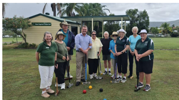
Bottom left to right: Mt Sugarloaf Croquet Club and Cessnock Amateur Swim Club.