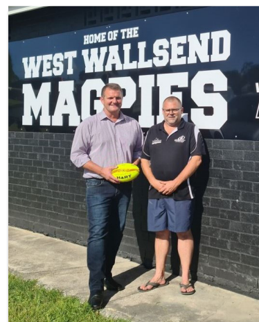
Above: West Wallsend Junior Rugby League.